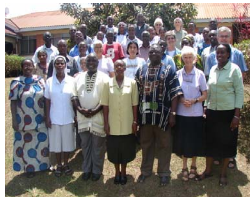
The religious who participated

From August 2 nd -16 th : 42 religious working for JPIC coming from East Africa, gathered, at St. Augustine’s Institute seeking to network better and so to be more efficient in the work of promoting JPIC. This Forum was launched by the JPIC Commission of the Major Superiors Union in Rome (USG/UISG) in collaboration with JPIIIPC. The main themes presented were: Peace Building and Conflict Resolution, Inter-Religious Dialogue, Gender and Human Rights, Catholic Social Teaching and the Experience of Networking in JPIIIPC.