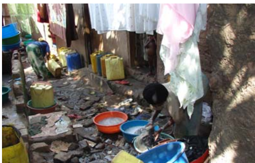
One of the slums in Kampala

The findings of the research carried out by JPIIIPC in ten slums of Kampala was first of all shared with the slum dwellers themselves. The aim was to see what they can do with the findings by themselves to improve their own situation. If better informed and organized, they can claim from their local leaders and civil servants greater transparency, accountability and better services.