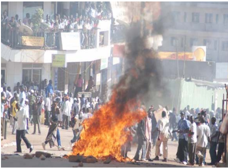
Picture of the recent riots in Kampala

We continue to face serious challenges in Uganda and they are on the increase: violence and riots (10 th -12 th Sept) . The immediate trigger of the riots was the stand of the Government preventing the King from visiting his territory in Kayunga.